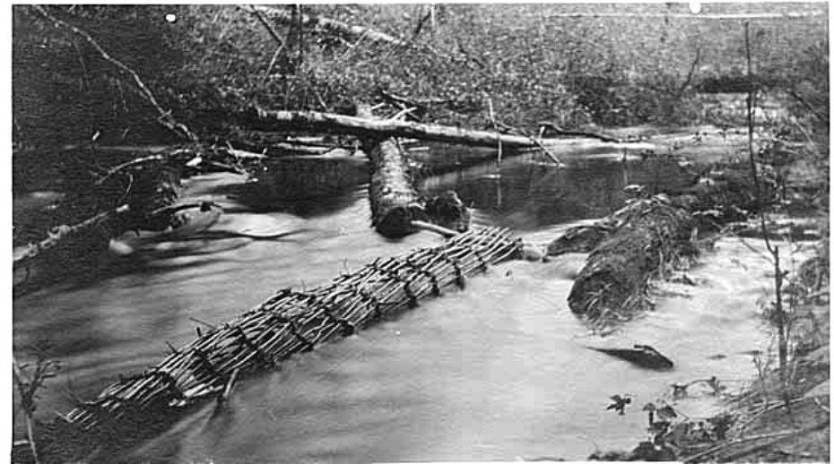
Basket fishing traps, probably in Auburn, ca. 1923 Courtesy UW Special Collections (Neg. No. 439)

The complete text of the Treaty of Point Elliott can be found on HistoryLink.org .